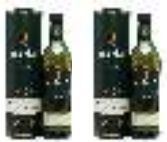
GLENFIDDICH 12 YEARS