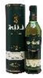
GLENFIDDICH 12 YEARS