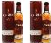
GLENFIDDICH 15 YEARS