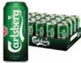
CARLSBERG 24 X 330ML