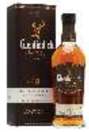
GLENFIDDICH 18 YEARS