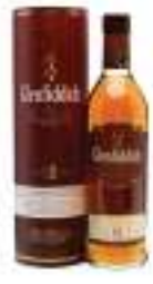
GLENFIDDICH 15 YEARS