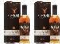
GLENFIDDICH 18 YEARS