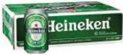
HEINEKEN 24 X 330ML