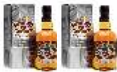
CHIVAS REGAL 12 YEARS