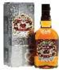
CHIVAS REGAL 12 YEARS